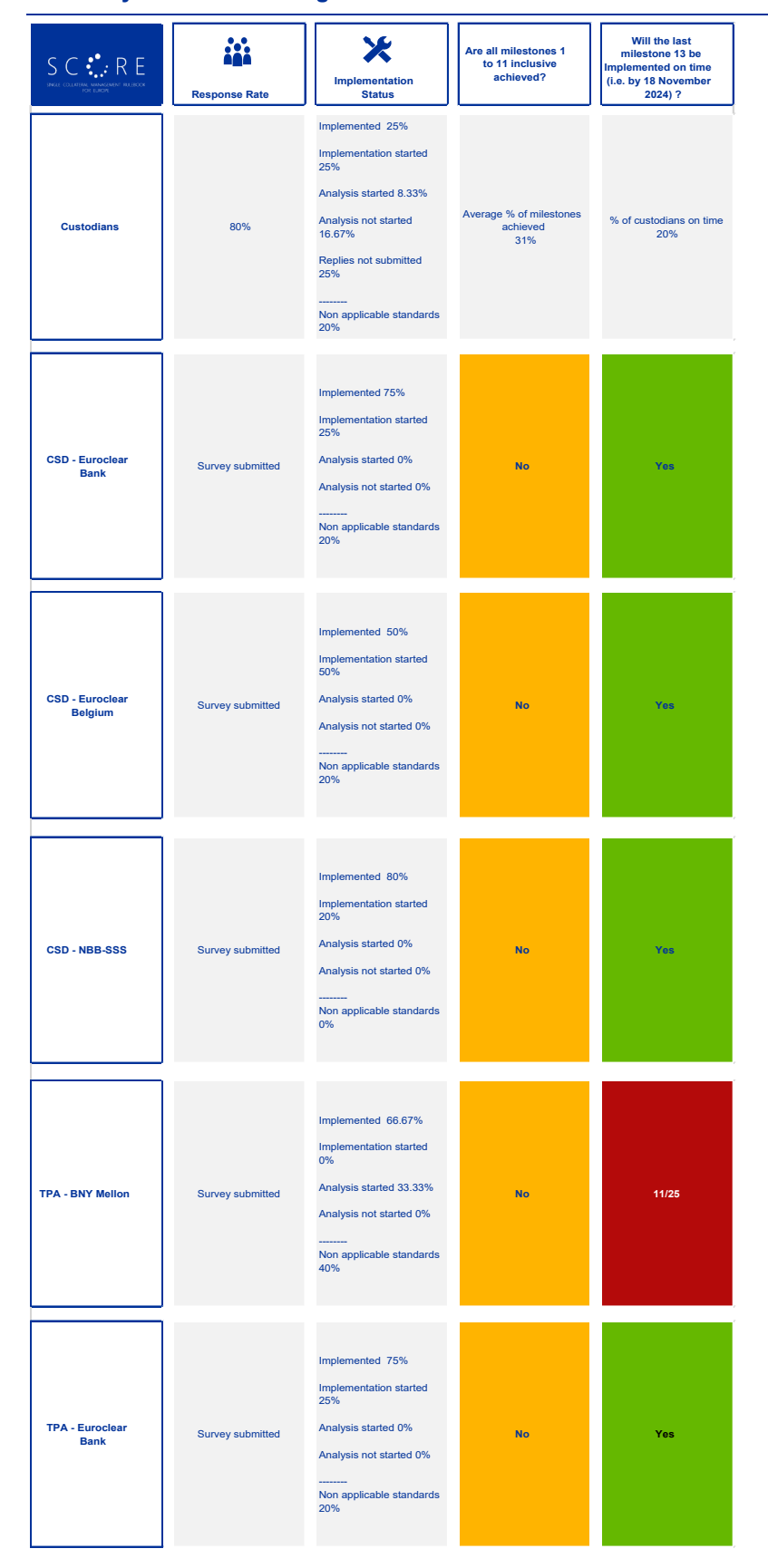
Figure 1 Summary of the monitoring exercise