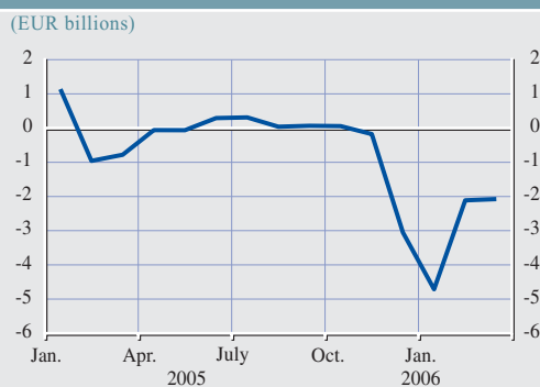
Chart B6.2 German real estate funds, monthly net inflows