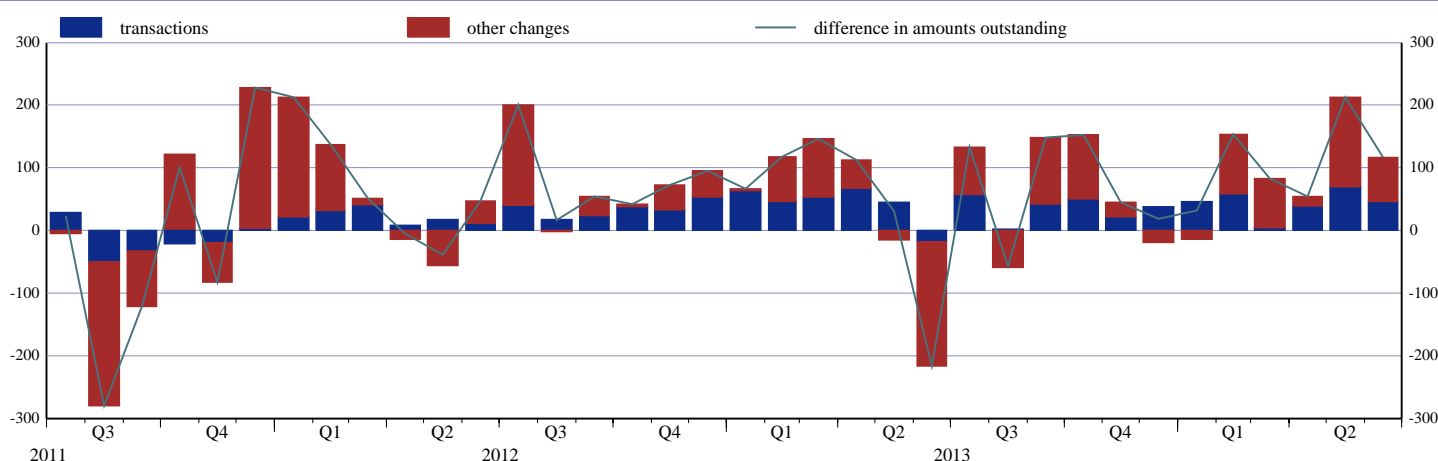
Chart 2 Transactions in shares/units issued by investment policy of euro area investment funds other than money market funds

(EUR billions; not seasonally adjusted; outstanding amounts at the end of the period; transactions during the period; monthly data)