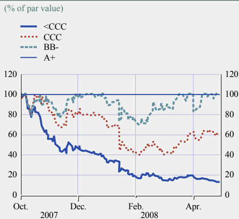
Chart A LCDX index-implied prices on different tranches of leveraged loans