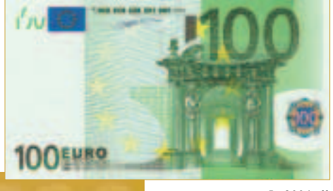
In 2004 all publications will carry a motif taken from the €100 banknote.